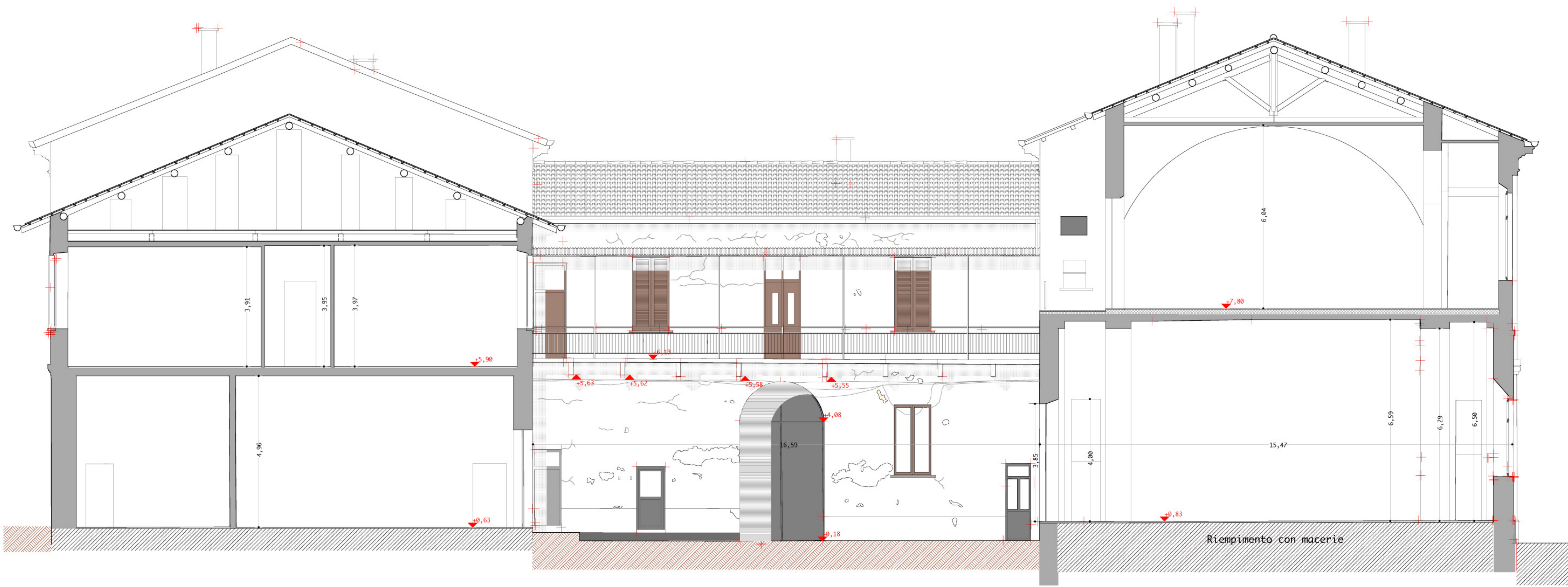
PROSPETTO CORTILE LATO OVEST